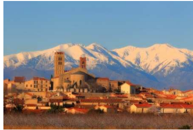
LE MONT CANIGOU