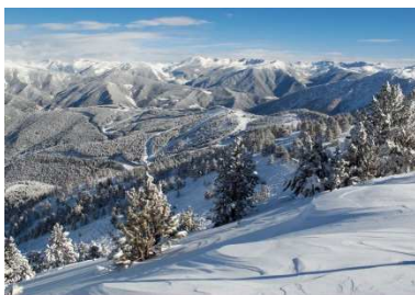
PYRÉNÉES - à 1h de Perpignan