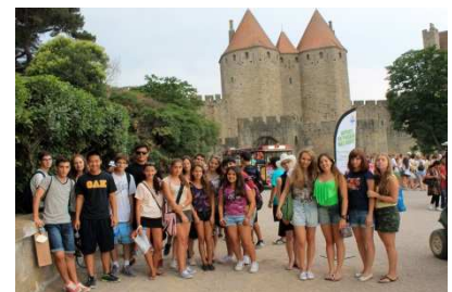
CARCASSONNE - à 1h