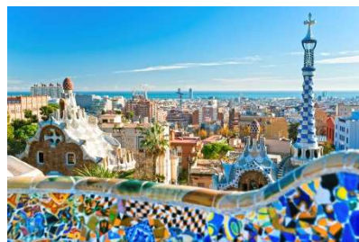
BARCELONE - à 1h10 en TGV